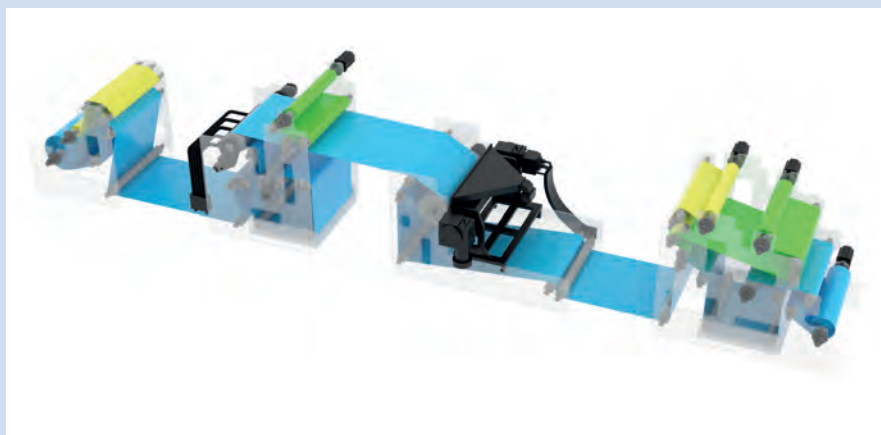
5 Scheme of atmoFlex 1250

4 SEM cross-section picture of a permeation barrier layer system, consisting of two vacuum deposited barrier layers and a planarization layer, deposited by wet coating – a surface defect of the substrate is effectively covered